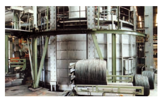
Figure 1. Conti Rotary Table Furnace for solution annealing

Due to its geometry and the circulating combustion gases, the external layers of the wire coil will heat up more quickly than the internal layers. Aiming at a high and homogenous material quality it is reasonable to heat up the charging material in two phases. In the first phase, the material is heated up to a temperature at which the carbon is dissolved without grain growth. Following a temperature compensation between the external and internal coil layers further heating up to the target temperature takes place including another temperature balance between the external and internal layers. For a division of the heating zones, a raisable and lowerable dividing wall can be installed in the furnace.