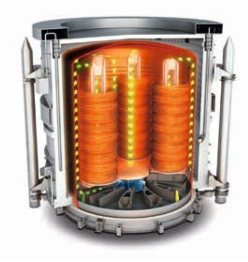
Figure 6: Bell-type base with stationary charging places Bell-type annealing furnace.

Figure 6 illustrates the general structure of an HPH®