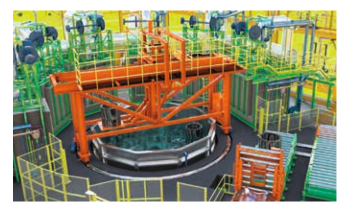
Figure 4. Batch Furnaces incl. quench and manipulators

The accuracy of the heating process, soaking at a suitable temperature and cooling speed are key factors for the final mechanical property of the material and repeatability of the process. They allow the end user to reach highest quality standards, as required on the "High Value" steel product market, such as aerospace and military.