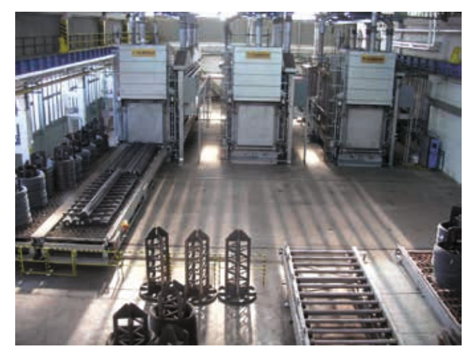
Figure 8. Semi-continuous STC®-furnace

The semi-continuous short time cycle (STC<sup>®</sup>) roller hearth furnace has a standardised size from 4 to 56 ton per charge capacity. Due to its modular configuration, the furnace can be pre-assembled in the workshop allowing an easy installation on the site (Figure 8).