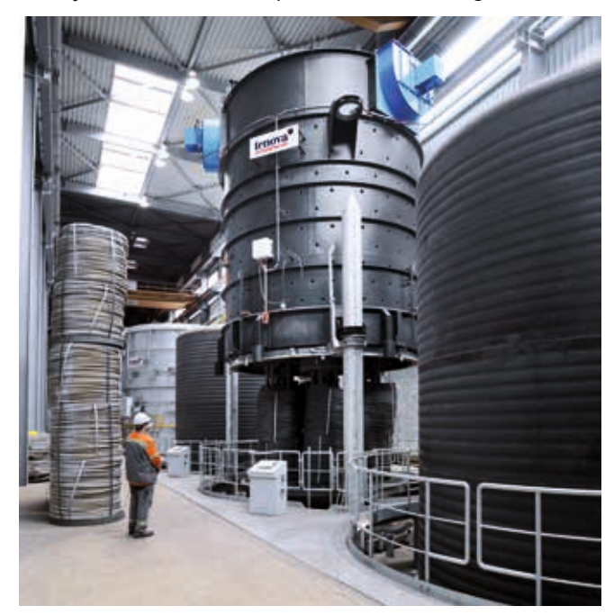
Figure 5. Multi-stack Bell-type Annealing Furnace

Multi-stack Bell-type furnaces (Figure 5) are used in the Wire industry (wire rolling mills and wire drawing shops) for the heat treatment of rolled wire and drawn wire coils. The heat treatment of rolled wire (spheroidising annealing) does not only aim at the low tensile strength indispensable for the subsequent cold forming process but additionally at a defined structure including a globular cementite ratio of min. 90 %. The following feature is typical of this annealing: upon a heating-up time to the conversion temperature Ac1 and a holding time, a controlled slow cooling to a temperature significantly below Ac1 takes place in the heating hood.